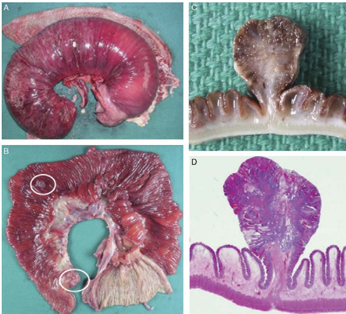
FIGURE 2. Hamartomatous polyp in intussusception in Peutz-Jeghers syndrome. A, Gross specimen of resected small bowel demonstrating intussusception. B, Opened small-bowel resection revealing gross appearance of polyps, indicated by circles C and D, A hamartomatous polyp from the small-bowel resection with both gross (C) and histologic (D) cross-sections demonstrating extension of the smooth muscle layer from the muscularis propria into the core of the polyp, characteristic of a hamartomatous polyp.

unaffected parents. The father’s maternal uncles were reported to have freckles on the face, although neither the father nor his mother had these findings and no photographs were available to confirm this report. There was no family history of GI abnormalities.